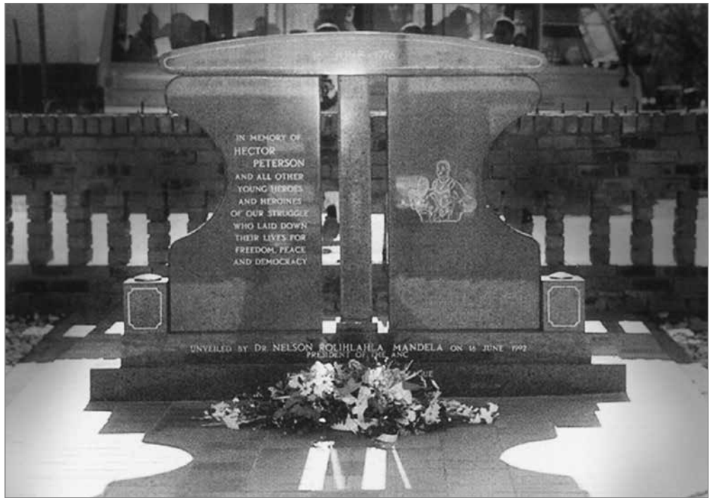
Postcard courtesy of the Hector Pieterson Memorial and Museum Archives

The original layout of the cenotaph, initially erected by the ANC Youth League at the intersection of Khumalo and Moema Streets. This site was provisionally declared a national heritage site by the then National Monuments Council which was later replaced by the South African Heritage Resources Agency.